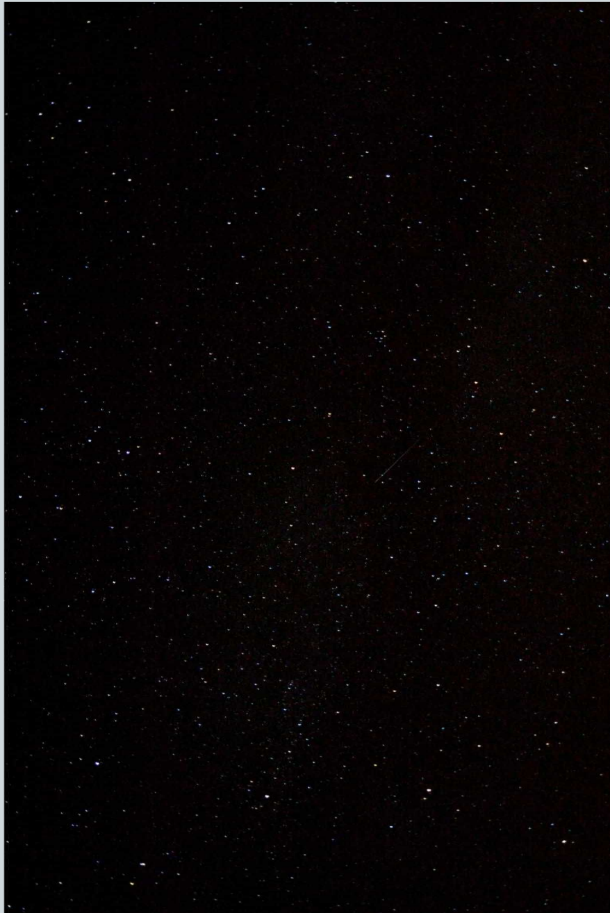
Rural Illinois Sky