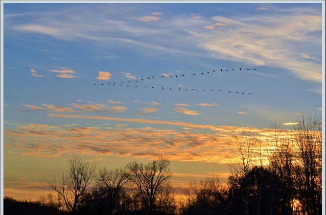
Sandhill crane migration, Sherburne National Wildlife Refuge, Zimmerman, MN