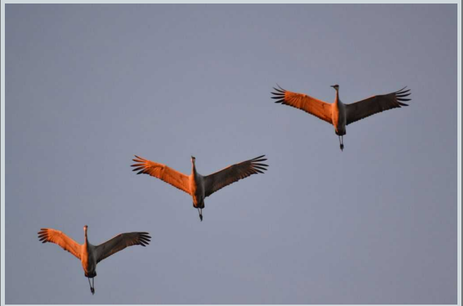
Sandhill crane migration, Sherburne National Wildlife Refuge, Zimmerman, MN