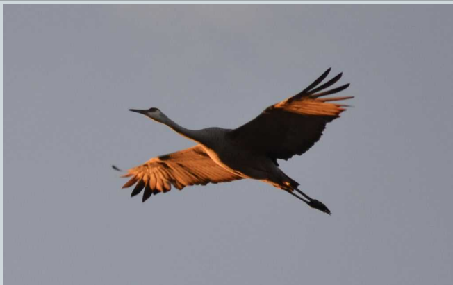
Sandhill crane migration, Sherburne National Wildlife Refuge, Zimmerman, MN