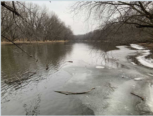
Mississippi River, Cloquet Park, Dayton, MN