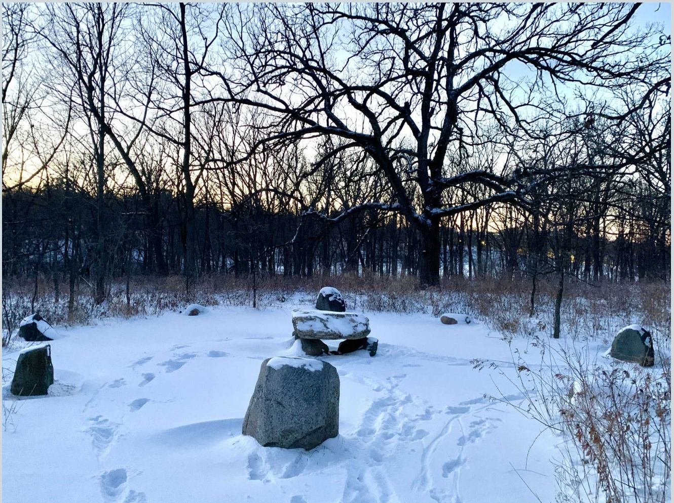
Photo: Druid's Circle, Carleton College Cowling Arboretum, Northfield, MN